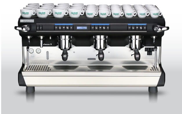
Classe 9USB - 3 groups